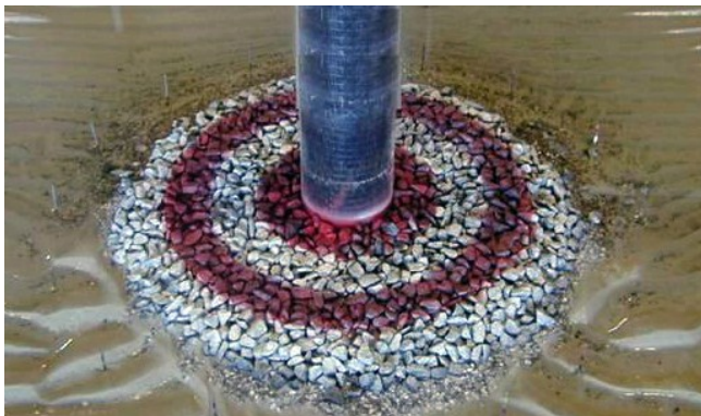
Optimising scour protection using physical model tests.

Today, scour protection for a single wind turbine foundation may cost up to EUR 150,000, which adds to the high investment costs. Accurate long-term predictions of scour may reduce this cost and enable the development of innovative solutions, such as improved J-tube designs.